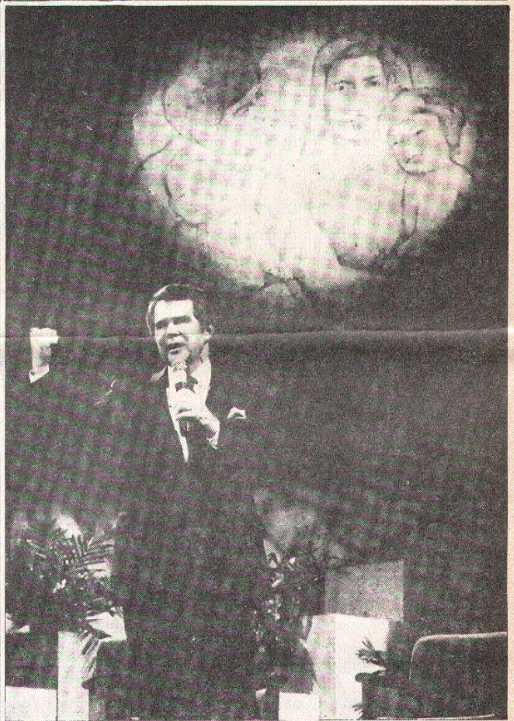
Pat Robertson on "The 700 Club"

For four days this week several thousand religious broadcasters and assorted believers in the electronic message turned the Sheraton Washington Hotel into a gigantic prayer camp. The theme was "Reaching the Family." Possibly never have so many people in radio and television under one roof been greeted as Brother this or Sister that. It was hokey, and it was holy. It was sacred, and it was profane. There were