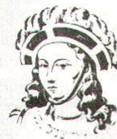
Joan of Arc