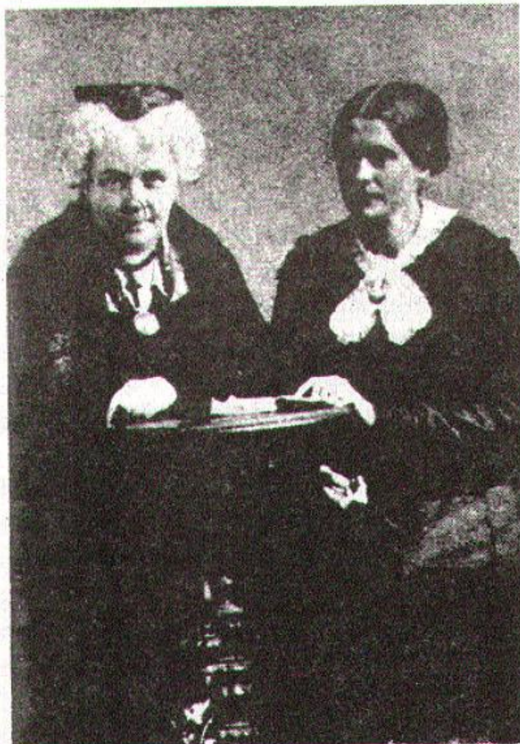
Elizabeth Cady Stanton and Susan B. Anthony

On July 4, 1876, while the nation was celebrating one hundred years of progress, Susan B. Anthony and some other fighters for women's rights attended the celebration of the nation's birth in Philadelphia and presented the "Declaration of Rights of the Women of the United States." Miss Anthony read the "Declaration," which demanded the vote for women: "While the Nation is buoyant with patriotism, and all hearts are attuned to praise, it is with sorrow we come to strike the one discordant note, on this hundredth anniversary of our country's birth. When subjects of Kings, Emperors, and Czars, from the Old World, join in our National Jubilee, shall the women of the Republic refuse to lay their hands with benedictions on the nation's head?... Yet, we cannot forget, even in this glad hour, that while all men of every race and clime, and condition, have been invested with the full rights of citizenship, under our hospitable flag, all women still suffer the degradation of disenfranchisement.